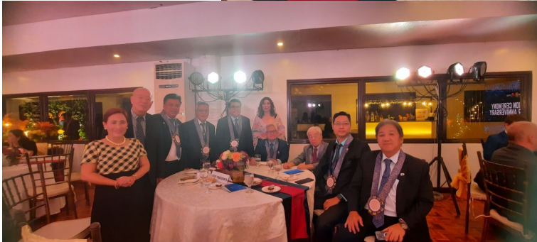
Rotary Club of Tacloban—Induction Ceremony at Pacific Point on Aug, 19, 2023 at 5:30 p.m.