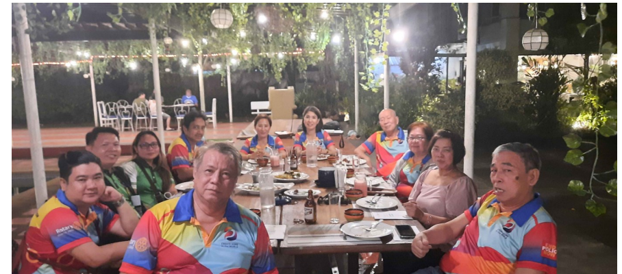
Rotary Club of Leyte Gulf business and Fellowship Meeting at Hacienda Verde Pool side on August 11, 2023 at 6:30 p.m.